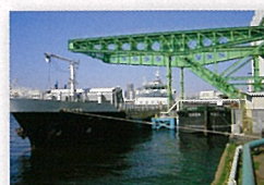
Steel Transit and Warehouse Business