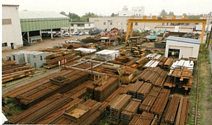
Tohoku Scrap Center