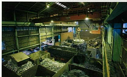
In the Factory