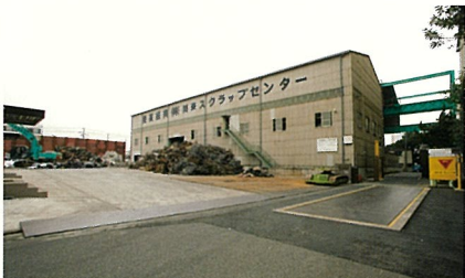
Kanto Scrap Center