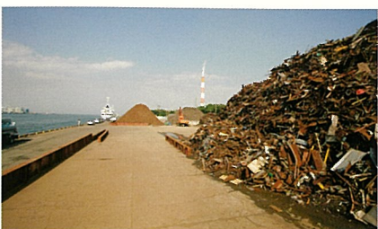
Kyusyu Raw Materials Dept.