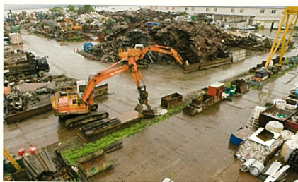
Hokkaido Raw Materials Dept.

We are committed to environmentally friendly and effectively use of this precious resource.