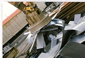
Raw Materials Business