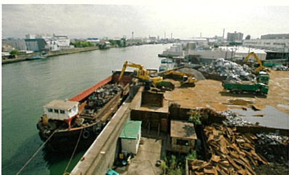
Chubu Kansai Scrap Center