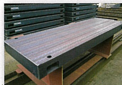
Steel Processing and Sales Business