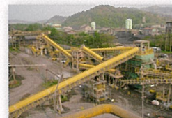
Iron Works Contracting Business